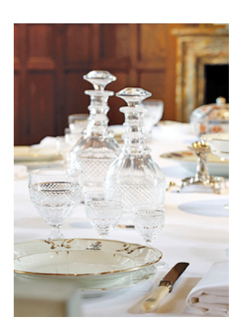
Table in the Dining Room, Saint Louis glasses and carafes, 19^{\rm th} century.

At the far end of the room is a remarkable bust in white marble and bronze of Henry IV in his robes.