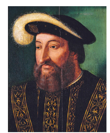
Francis I, French School, ate 16th - early 17th century.