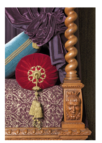
our-poster bed in the Renaissance Chamber